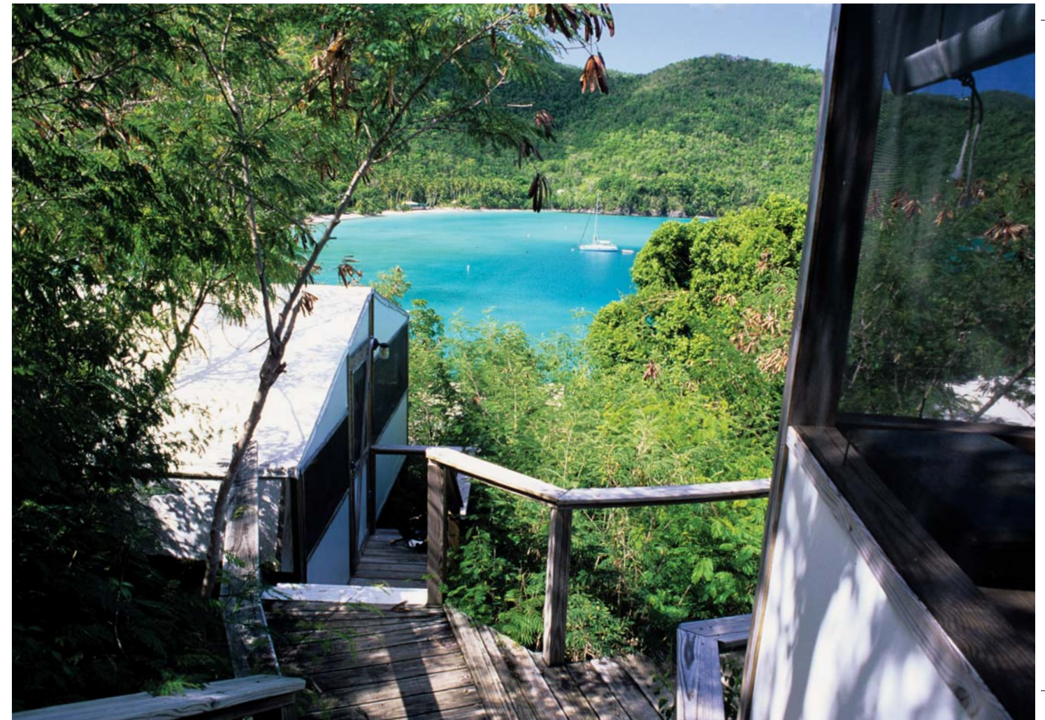
Maho Bay camps, a popular ecotourism resort.

reach of cities and suburbs are increasingly hard to find and important to protect. The Trust for Public Land’s Natural Lands initiative works with agencies and communities to conserve these lands for all Americans to enjoy. Some of the many natural places TPL has helped protect include the Columbia Gorge National Scenic Area in Oregon; Ohio’s Cuyahoga River National Recreation Area; the Pelican Island National Wildlife Refuge in Florida; and numerous lands in the Sierra Nevada of California. For more information, go to tpl.org/naturallands .